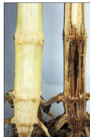
Healthier stalk on the left shows the benefits of fungicide treatment versus untreated stalk on right.